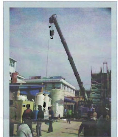
Installation of an oxygen plant has been completed. Pipes to the wards are being installed.

Work to install an oxygen plant and piping to patient beds in the wards commenced in August 2011 and is nearly complete. This new installation replaces the use of oxygen cylinders adjacent to patient beds, and simplifies and improves the safety and provision of oxygen to patients. The oxygen plant generates oxygen within Patan Hospital's premises and eliminates much of the cost and the delivery problems with cylinders furnished by outside sup-