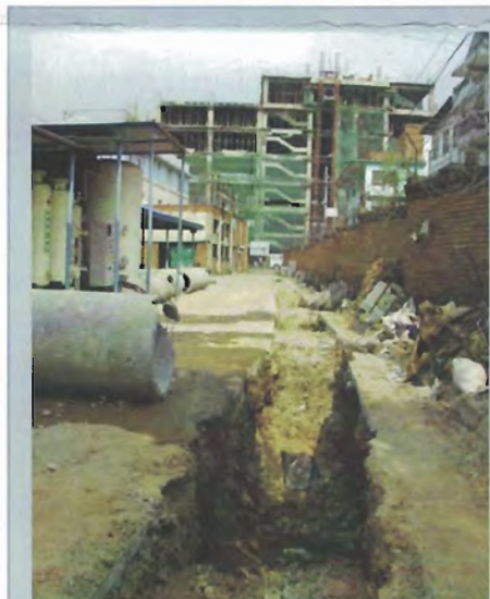
Construction of the new sewage system has begun.

The new sewage system will be deeper and bigger in diameter than the current system and will be connected to the main city sewage line when construction is completed.