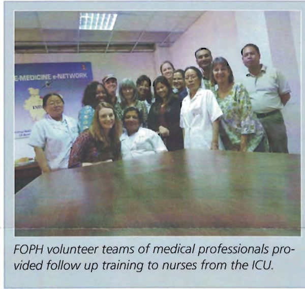
FOPH volunteer teams of medical professionals provided follow up training to nurses from the ICU.

FOPH continues to team with Project C.U.R.E. to ship needed medical supplies and equipment to Patan Hospital and Okhaldhunga Community Hospital. In February 2012 FOPH paid $19,000 to ship approximately $400,000 worth of medical supplies and equipment to Kathmandu, of which about 10% was for use at Okhaldhunga Community Hospital.