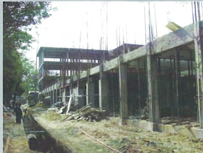
Construction of a new four-story building for the Pediatric Ward and medical school use.