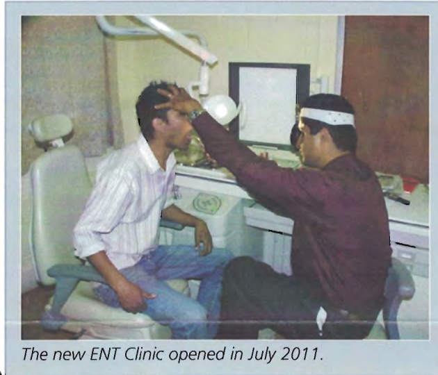
The new ENT Clinic opened in July 2011.