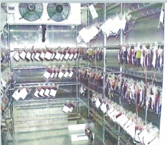
Installation on a new Cold Room has increased the capacity of the Blood Bank.