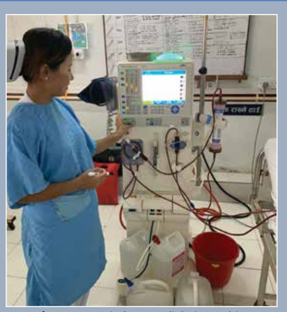
One of Patan Hospital's new dialysis machines.

minimum, Patan is able to provide quality care for pennies compared to the cost of similar care in the U.S. For those in dire need, the Charity Care Fund pays for hospital admissions that a patient's family cannot afford. In the past two years, thanks to your generosity, FOPH has given $90,000 – a new record for us - toward charity care at Patan.