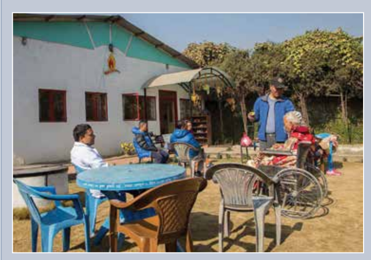
This current inpatient unit of Hospice Nepal includes eight beds.. Plans for a new 20-bed facility are underway.

provide similar services throughout Nepal, and they are developing a model of rural community-based palliative care that can be implemented in remote areas. To accommodate