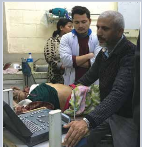
Emergency medicine fellows at Patan are learning to use bedside ultrasound to diagnose serious illness at minimal cost to the patient.

the expanding need for these services, Hospice Nepal is currently raising money to build a new 20-bed facility in Kathmandu. Monetary support for this endeavor can be sent directly to FOPH. As always, 100% of your contribution will be sent directly to Hospice Nepal. Read more at www. hospicenepal.org.np.