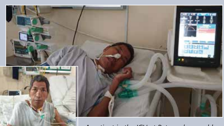
A patient in the ICU at Patan who would have otherwise died of tetanus. He recovered 10 weeks later!

As always, Friends of Patan Hospital prioritizes support for the neediest of patients by contributing as generously as we are able to the the Charity Care Fund at Patan Hospital. In order to remain financially viable, the hospital generally requires cash up front for all care it provides, as health insurance is virtually unknown in Nepal. By keeping its costs to a